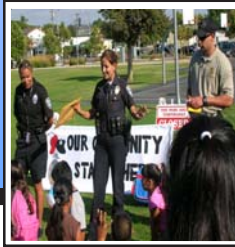
OUR COMMUNITY STARTS HERE

PAL is a unique community organization that fosters trust between youth and the men and women of the Santa Monica Police Department in a safe and nurturing environment. Through outstanding educational, cultural, recreational, and outreach programs, PAL helps develop skills and self-esteem, encouraging youth to reach their full potential.